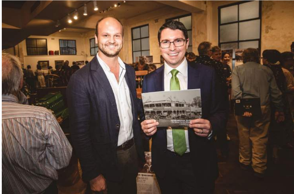
The Launch of 'From Hooves to Highways', 2020