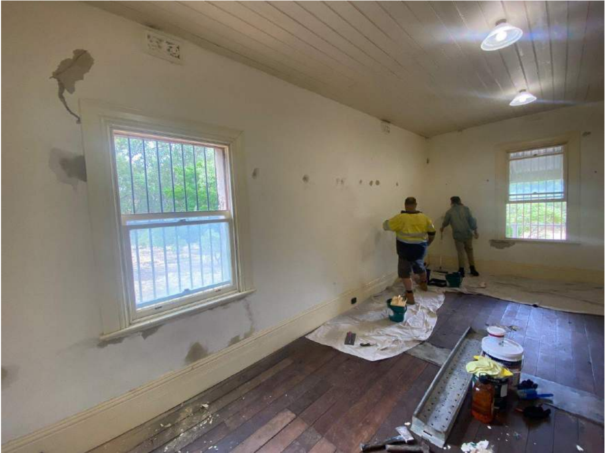
Re-plastering and painting works underway.