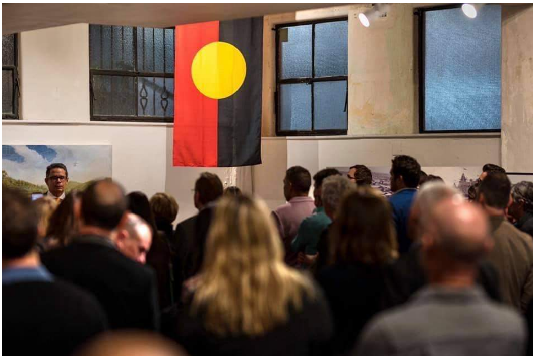
The launch of 'Gnaarla Boodja Mili Mili' (Our Country on Paper), 2021, in partnership with the State Government of Western Australia's Aboriginal History Unit.