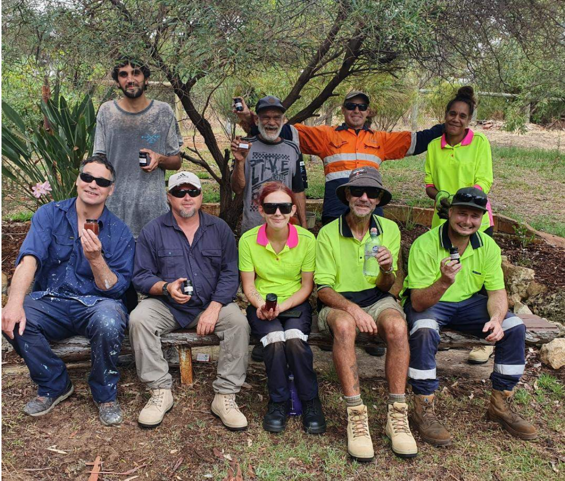
Our first intake of horticultural trainees.