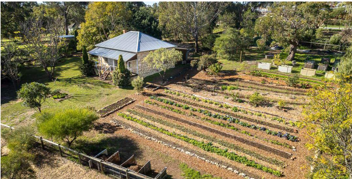
Sloans Cottage, Leda. 2022