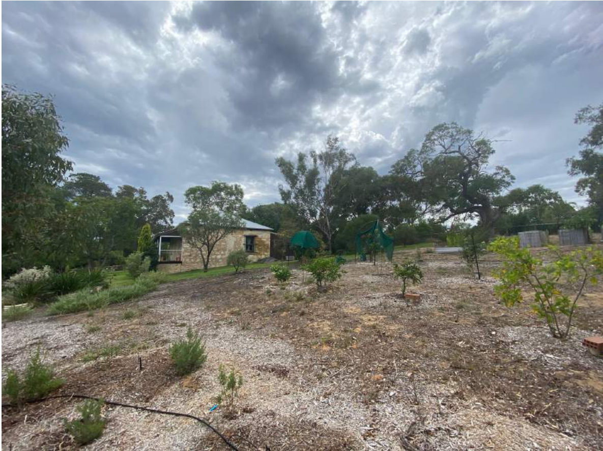
2021 before we took over management.