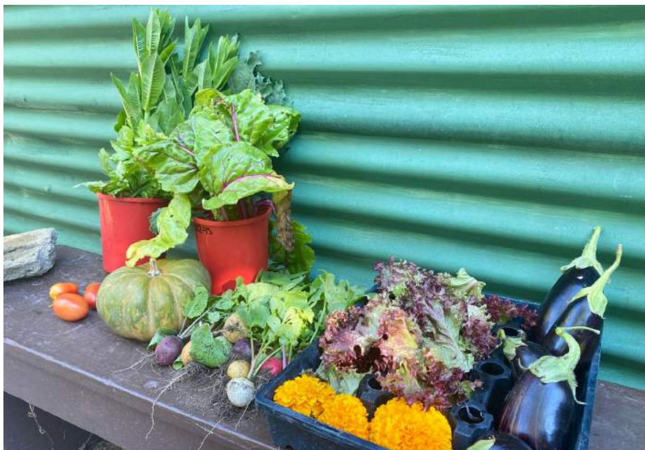
Produce from our garden