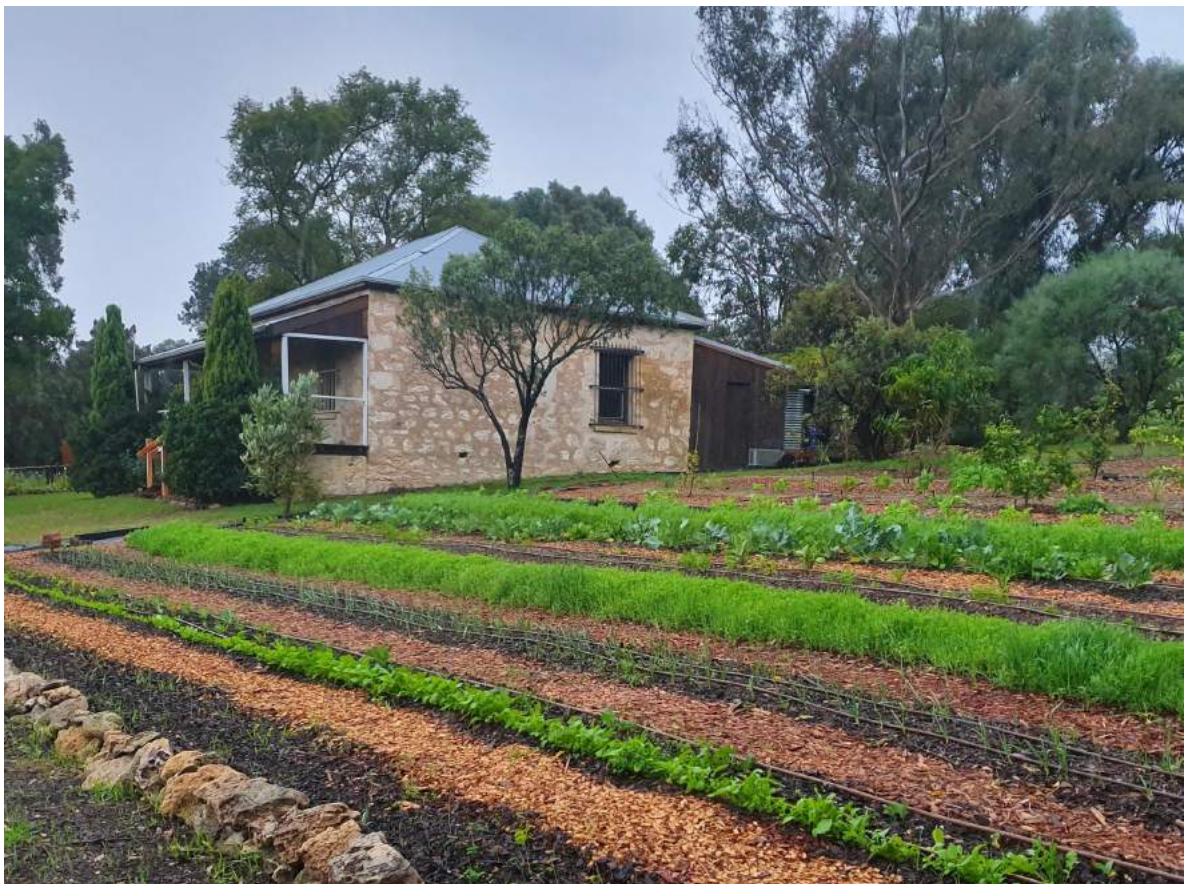
May 2022, after just 6 months.